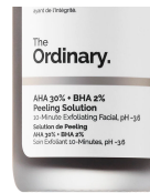
THE ORDINARY AHA 30% + BHA 2% Exfoliating Peeling Solution