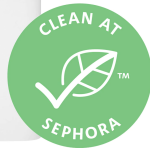
DRUNK ELEPHANT Scrubbi Bamboes™ Body Cleanser